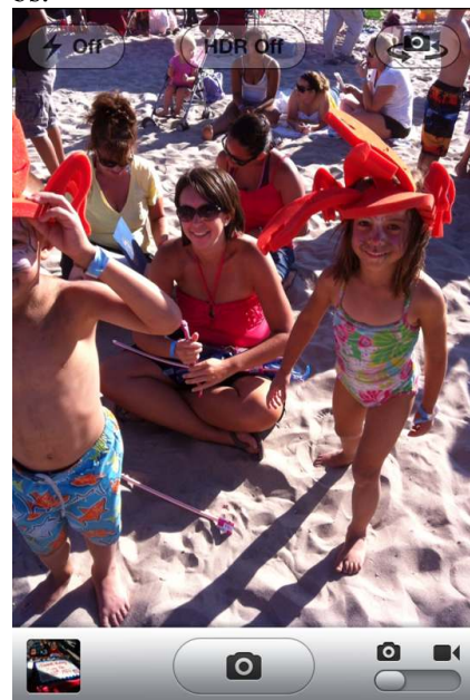
Marine families at the beach