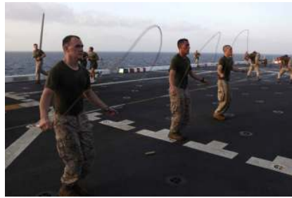
Marines exercising on deck and in the ship