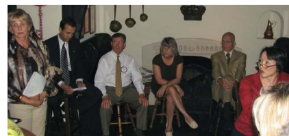
Lobsterfest committee met after our regular meeting