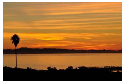
A view we can enjoy every evening