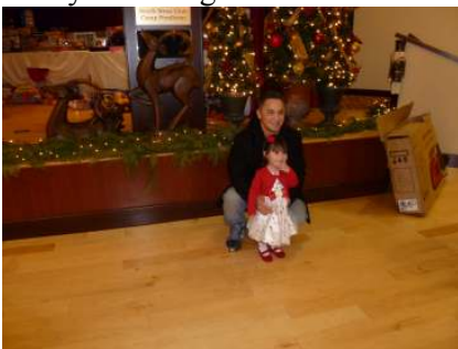
A proud Marine with his daughter awaiting Santa's arrival