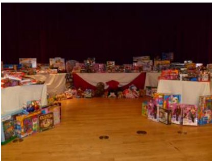
Toys awaiting Marine children