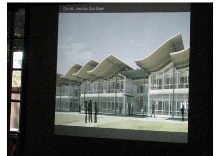
The Wave Roof