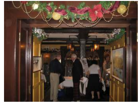
Welcome to Five Crowns