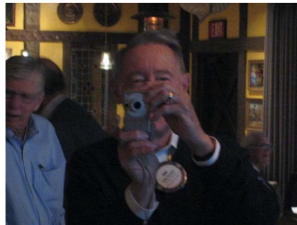
Club Photographer Phil Reynolds taking pictures