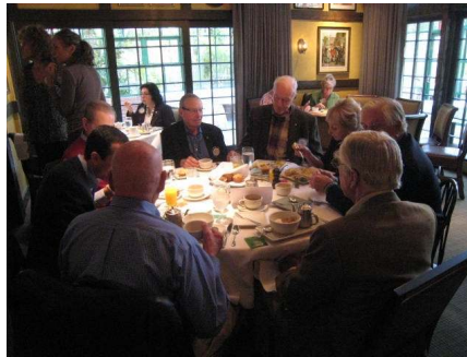
Center Table enjoying fellowship

Nov 29 Lillian Partida, CN, Nutritional Overview Dec 6 Hoag Blood Drive at Hoag Hospital Dec 13 Vic Ching, Paramount Studios Dec 16 Club Christmas Party @ Newport Beach Yacht Club – 5:30 Cocktails Dec 20 Klyan the Magician Dec 21 Board Meeting 7:30 am @ Coco's CDM Dec 27 DARK