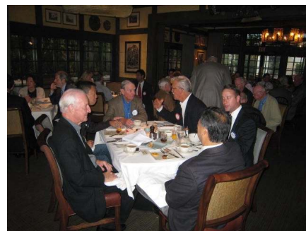
Rotarians building better relationships